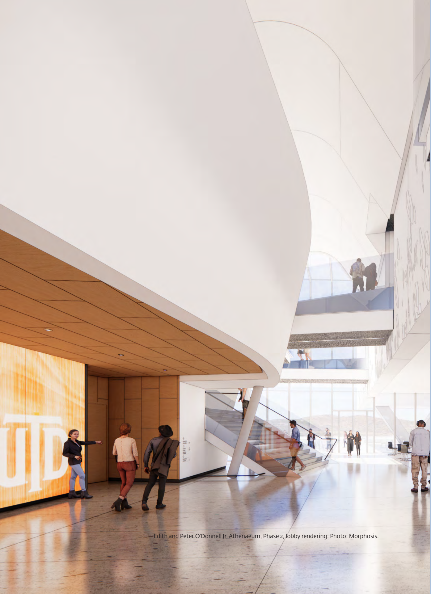
Edith and Peter O'Donnell Jr. Athenaeum, Phase 2, lobby rendering.