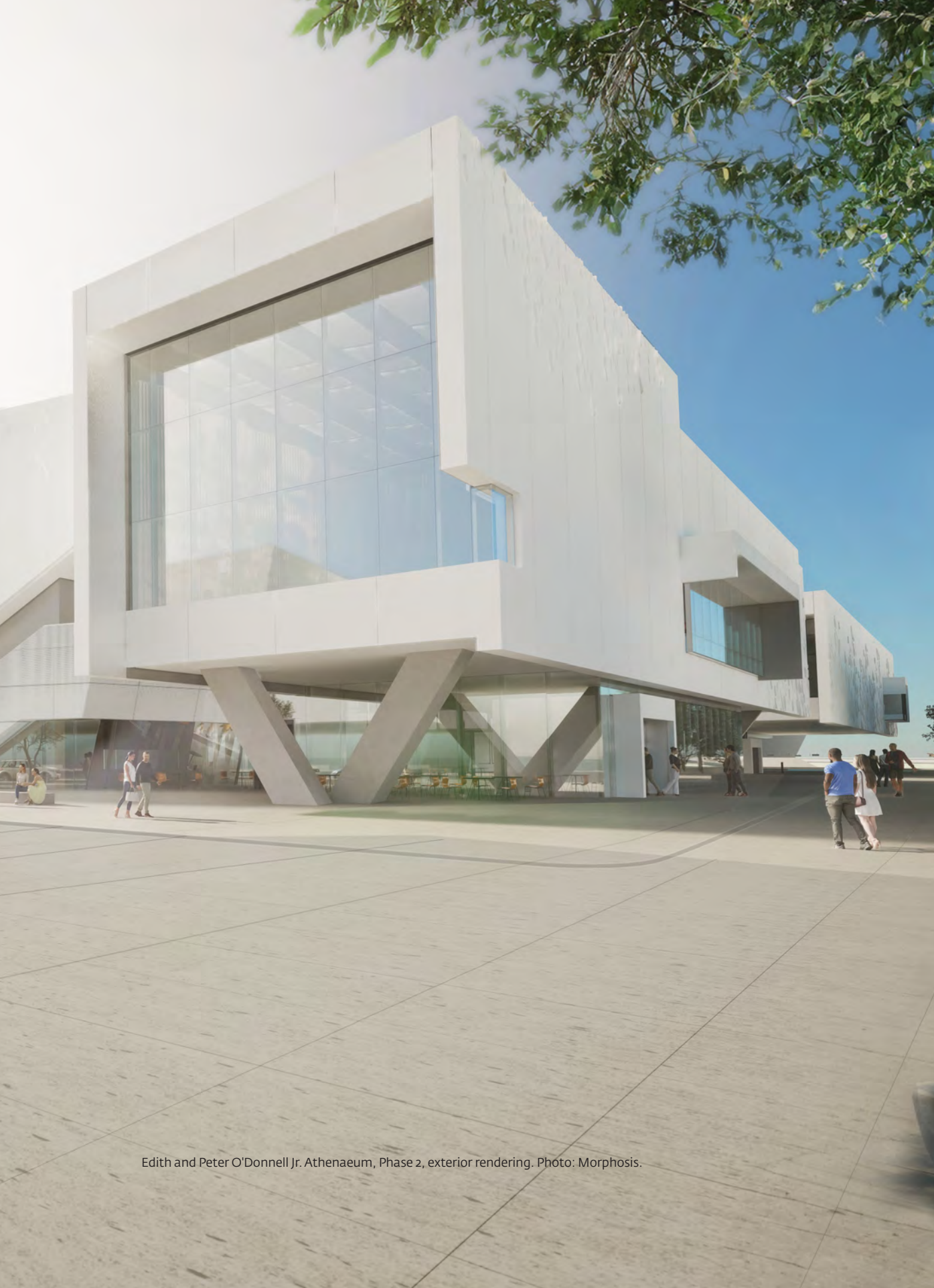
Edith and Peter O'Donnell Jr. Athenaeum, Phase 2, exterior rendering.