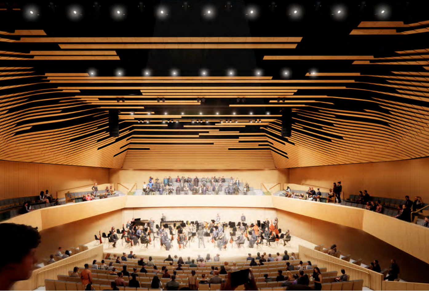
Edith and Peter O'Donnell Jr. Athenaeum, Phase 2, performance hall interior rendering.

The centerpiece of Athenaeum Phase 2 is its 680-seat performance hall, equipped with a stage large enough for prestigious ensembles like the Dallas Symphony Orchestra. The building will also house faculty offices, two large classrooms, two rehearsal halls, a piano lab, a harp studio, practice rooms, and storage space for all our instruments. This facility will provide our students with everything they need to excel in their musical pursuits and will foster the vibrant artistic community we all cherish.