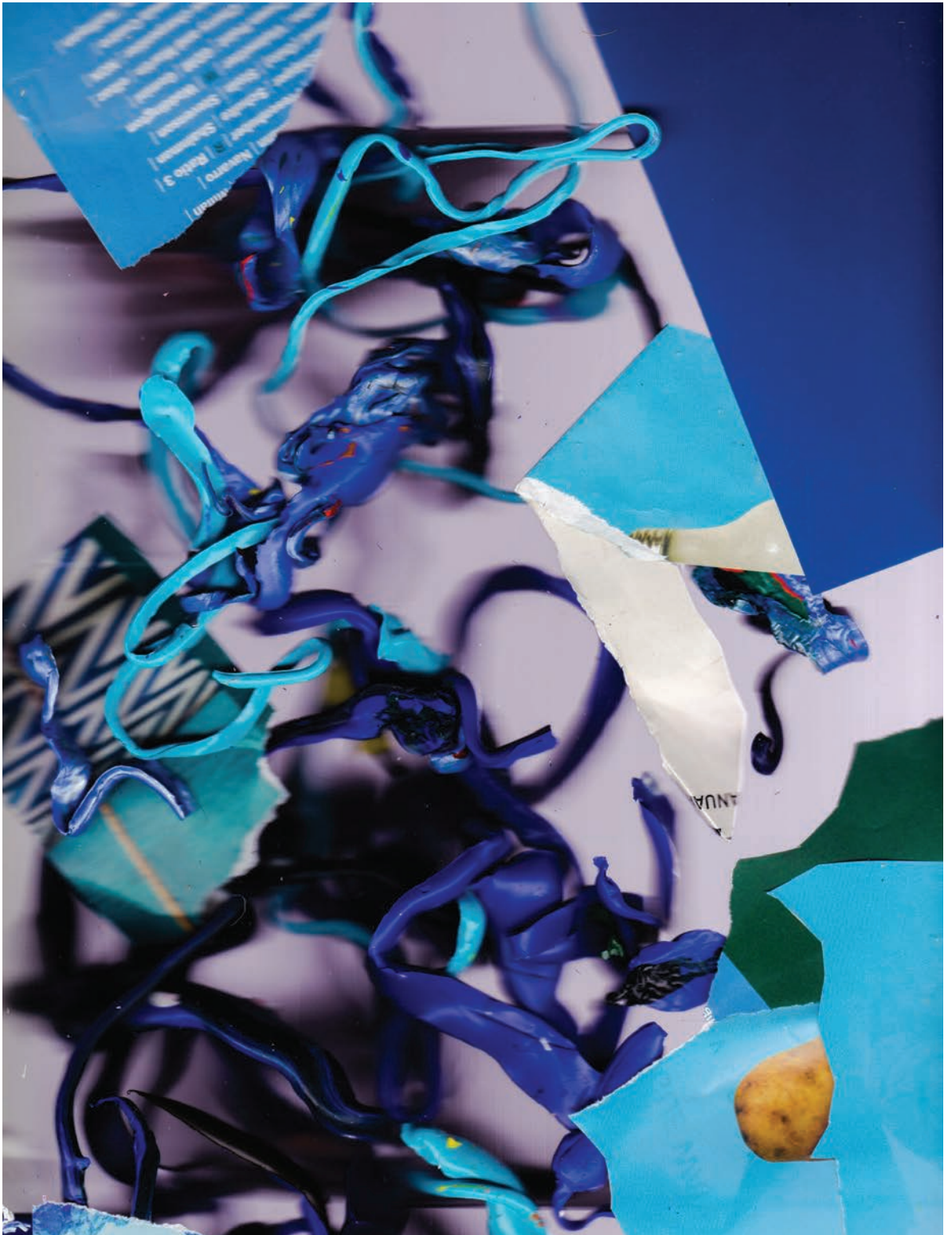
Liz Trosper, baldessari in blue , 2017. UV ink on canvas, 96 x 74 inches. Copyright © 2017 Liz Trosper.

Read our interview with Liz Trosper at athenaeumreview.org .