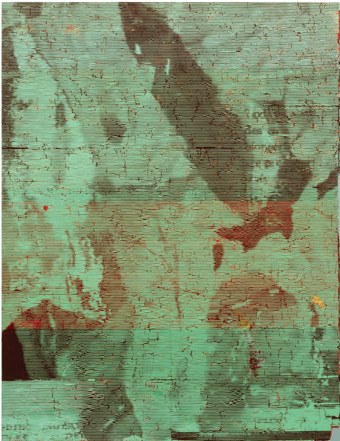
Luke Harnden, Bay . 2017. Acrylic on canvas, 62 x 48 inches. Copyright © 2017 Luke Harnden.

Read our interview with Luke Harnden at athenaeumreview.org .